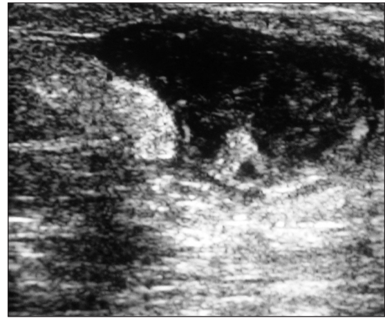
Figure 1: Ultrasonographic mammography image of the left breast showing heterogeneous, hypoechoic lesion with thick septations and internal echoes suggestive of complex cystic lesion

Patients usually present with a painless breast lump that increases in size over time. It generally affects women between 30 and 50 years of age, although ages from 20 to 74 years have also been reported. [6] It should be differentiated from fibroadenoma in young patients and carcinoma in older patients. [7] When secondary infection occurs, hydatid cyst of the breast cannot be distinguished from breast abscess, clinically or by mammography. [8] Triple assessment, i.e. clinical assessment, USG and FNAC, is used for the diagnosis of breast lumps. In the present case, clinical assessment was suggestive of galactocele but FNAC and USG were diagnostic. Serological tests such as enzyme-linked immunosorbent assay for Echinococcus can also be used for the preoperative diagnosis of hydatid disease. [7]