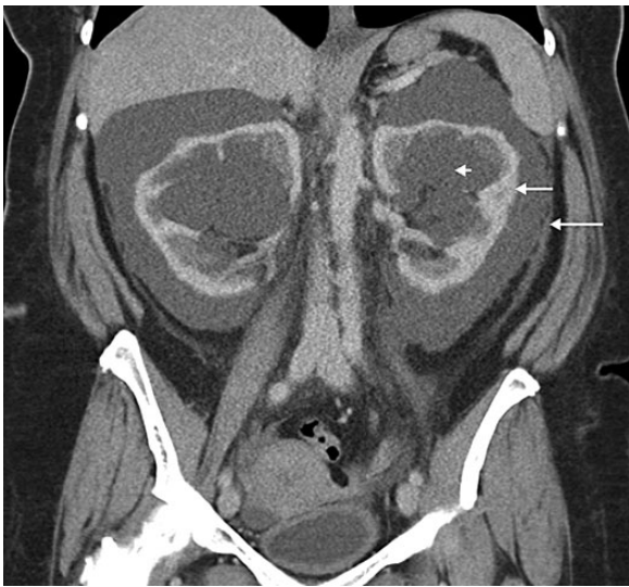
Fig. 1. Coronal CT showing perinephric fluid (long arrow) surrounding renal cortex (medium arrow) and parapelvic fluid (short arrow).