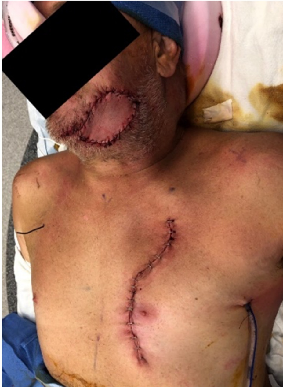
FIGURE 3: Postoperative left pedicled myocutaneous pectoralis flap.

The patient tolerated the procedure well and was transferred to the floor in stable condition. Dental arch bars were removed on postoperative day 14. At that time, the patient was tolerating a liquid diet and had no complaints of pain or discomfort in regards to speaking or opening/closing of his jaw. He was discharged post-op day 15 with a scheduled follow-up appointment with his primary care physician and was compliant with follow up in the Plastic and Reconstructive Surgery clinic.