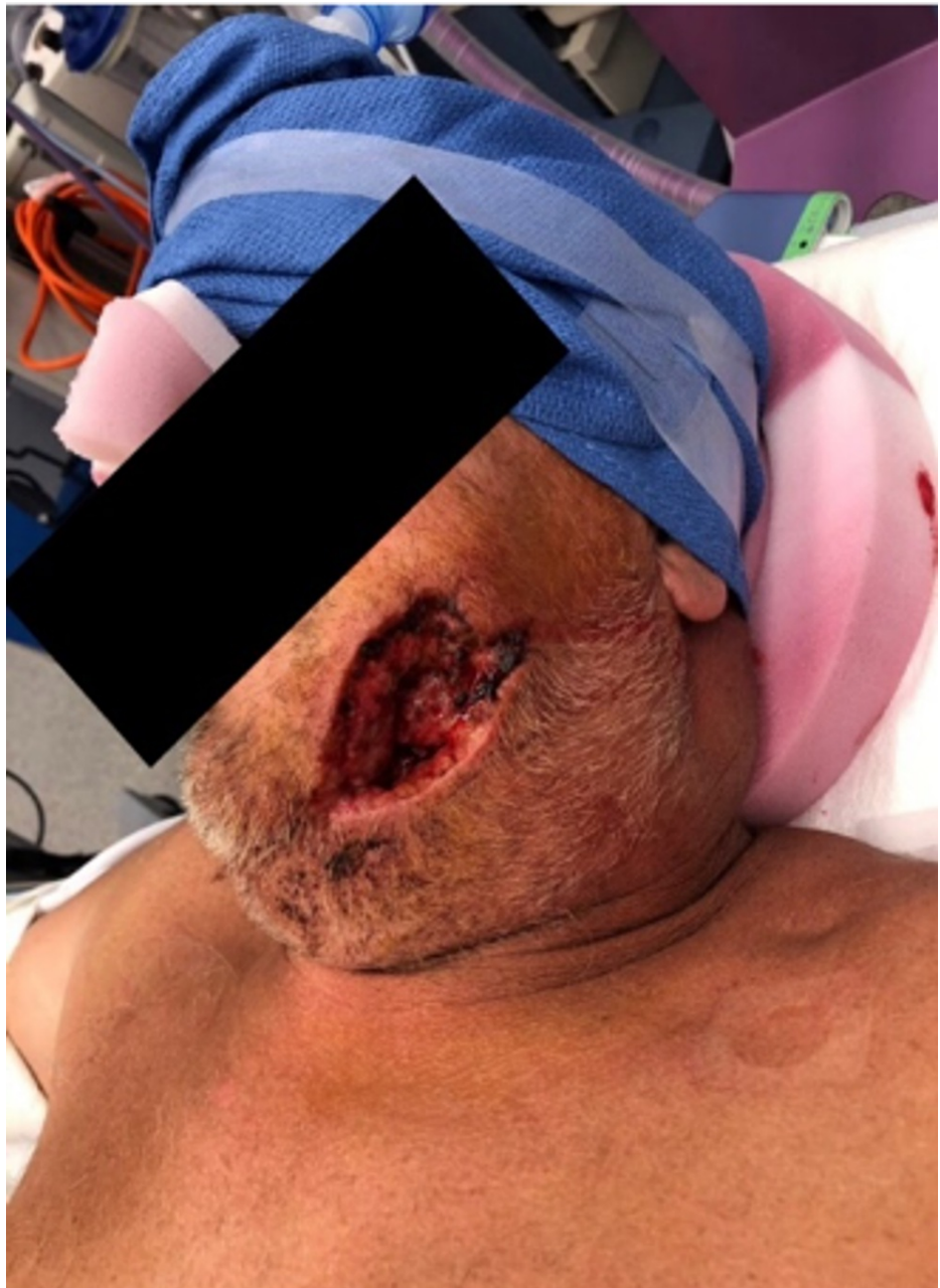
FIGURE 2: Preoperative evaluation of the extent of injury (left mandible).

The patient was further evaluated and subsequently underwent exploration and debridement during post-trauma day one. Multiple comminuted fragments of bone were debrided and removed at that time. The following day, the patient underwent mandibulomaxillary fixation with Synthes matrix wave, including open reduction and internal fixation (ORIF) of the left mandible fracture with a Synthes 2.5 mm locking plate. In addition, a left pectoralis major myocutaneous muscle flap with subcutaneous tunneling was performed. A 6 x 8 cm skin pedicle medial to the nipple was dissected to the level of the pectoralis major muscle. The pedicle myocutaneous flap was rotated and passed through a subcutaneous tunnel and above the clavicle to the facial defect (Figure 3).