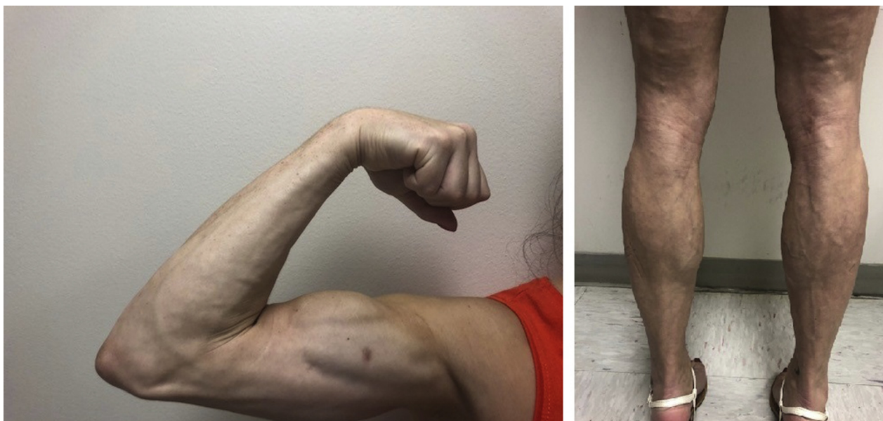
Fig. 1. Upper and lower extremities of the patient demonstrated paucity of subcutaneous tissues and exhibited impressive muscular contours and definitions.

The LMNA gene consists of 12 exons and 5 major domains. The particular mutation in our patient, c.1445G>A, p.Arg482Gln, is located in the exon 8 within the tail domain that contains a nuclear localization signal, immunoglobulin signal, and CAAX box with a