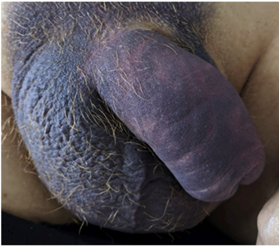
Fig. 1. Patient with extensive bruising. Unable to identify the site of the fracture on clinical examination alone.