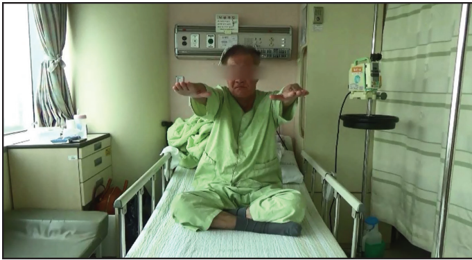
Video 2. After Intravenous Amantadine Treatment. Partial improvement of chorea involving the face, neck, and both the upper extremities and some restoration in gait and postural balance is observed. At follow-up interview on symptoms, the patient reported improvement in using spoon while eating and in gait.

emission tomography (PET) scan, decreased uptake in the bilateral striatum, especially in the caudate nucleus was obtained (Figure 1C). The anti-CV2/CRMP5 autoantibody was tested positive in a qualitative analysis using serum and cerebrospinal fluid mixture. Meanwhile, the diagnosis of small cell lung cancer with metastasis in the lymph node, first lumbar spine, and left ureter was made based on the malignancy workup.