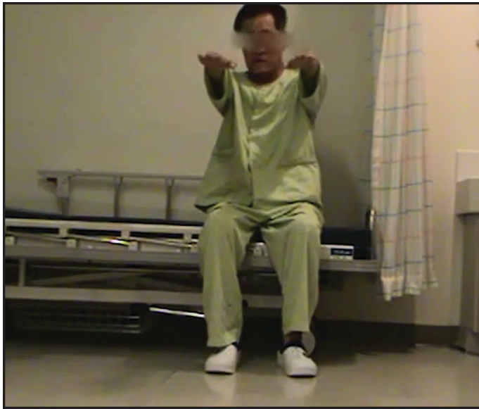
Video 1. Before Intravenous Amantadine Treatment. Chorea mainly involving the face, neck, and both upper extremities, with mild involvement of the lower extremities while sitting down with feet touching the floor is observed. Slight loss of balance and augmentation of chorea is noted when performing the pull-test. Wide-based choreiform gait with irregular step length differential is seen during free gait.

haloperidol (1.5 mg/d). At post-treatment, mild improvement of symptoms was observed initially with gradual worsening over the next 6 months. After increasing the dose of haloperidol, the improvement of chorea was achieved, but the development of Parkinsonism as a side effect was noted. Therefore, haloperidol was switched to quetiapine (400 mg/d), but the relapse of chorea was observed. When the patient was referred to our clinic 12 months after the symptom onset (Video 1), his previous medical records were not accessible.