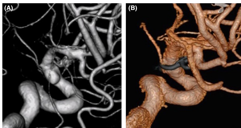
Figure 4. (A) Postoperative angiography revealing a residual of blood blister-like aneurysm (BBA) on the same localization. (B) A year postoperatively, angiography demonstrating the shrinkage of the aneurysm and patency of the internal carotid artery (ICA).