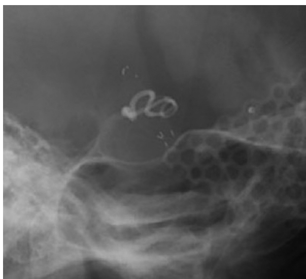
Figure 5. X-ray (right lateral view) showing that the lesion is covered with encircling clip and stent.