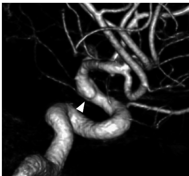
Figure 2. Cerebral angiography (right lateral view) revealing a subtle bump (arrowhead) on the antero-lateral wall of the supraclinoid internal carotid artery (ICA).

aneurysmal protrusion of the arterial wall, and we diagnosed this lesion as a BBA. An intradural clinoidectomy was performed because the proximal ICA exposure was inadequate. As direct placement of the clip presented the risk of aneurysm neck tearing or clip slippage, we elected to perform clipping on wrapping instead. After a temporary clip was placed on the proximal ICA, polyglycolic acid felt (Neoveil, Gunze, Ltd., Kyoto, Japan) was applied