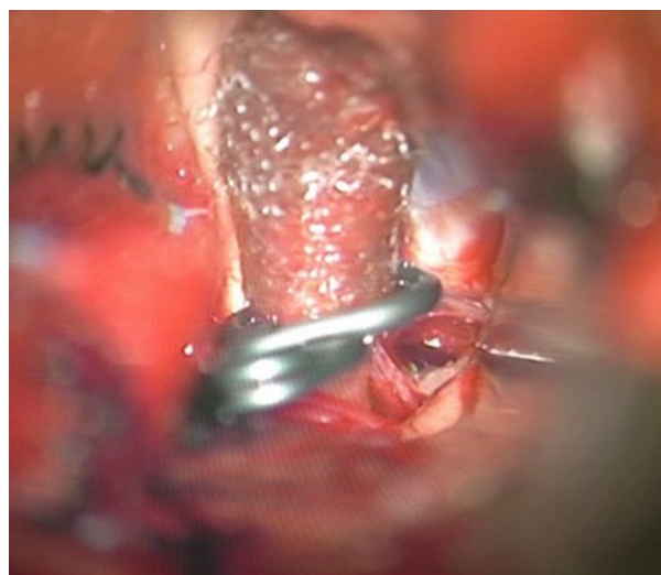
Figure 3. Intraoperative photograph showing clipping on wrapping of the aneurysmal segment of the internal carotid artery (ICA).