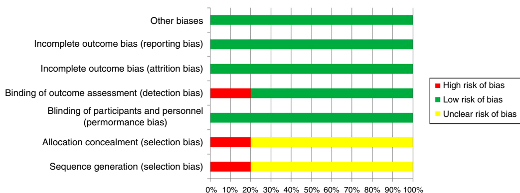
Figure 2 Risk of bias of eligible trials.