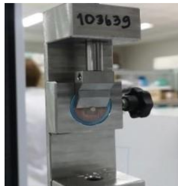
Figure 1. Test setup for shear bond strength.

A universal testing device (AGS-X 500N, Shimadzu Corporation, Kyoto, Japan) was used to evaluate the shear bond strength of the specimens. The shearing blade was positioned parallel to the intersection of the zirconia and resin composite. A shear pressure of 0.5 mm per min was set until fracture occurred (Figure 1). The shear bond strength in MPa was calculated by the maximum shear bond strength divided by the surface region of the bonding interface.