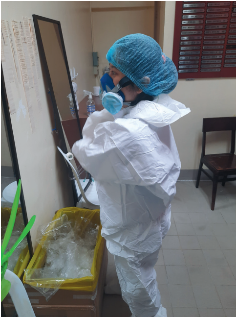
Photo: Filipino nurses' daily routine during the COVID-19 pandemic (from Rowalt Alibudbud's personal collection, used with permission).

40% of nurses in private hospitals have resigned since the pandemic began [3]. Thus, hospitals in the Philippines may be understaffed due to the dwindling number of nurses during the pandemic.