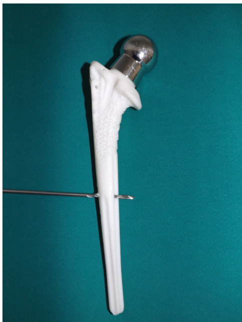
Fig. 3. The femoral component of the third-generation isoelastic RM® total hip replacement is easily perforated with a 3.2 mm drill due to their polymeric composition.