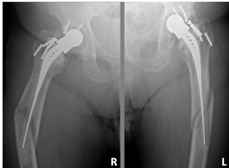
Fig. 2. Preoperative anteroposterior radiographs of the hips showing bilateral isoelastic prosthesis with osteolysis along the whole length of the femoral stem after 24 and 21 years in situ. Broken screws due to the prosthetic instability.

At 12-months follow-up, the patient presented an asymptomatic hips and expressed high degree of satisfaction with surgery result. He reported no pain in his thighs. The femoral radiograph showed consolidation of both fractures and the fibular structural allograft had no signs of bone resorption (Fig. 4). The patient was clinically able to walk without external support.