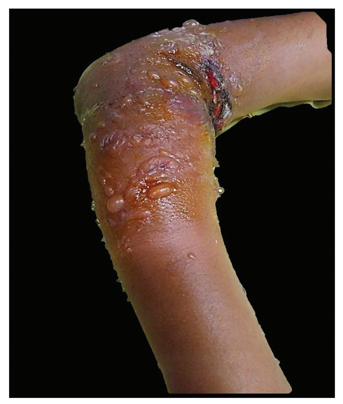
Figure 5: Irritant contact dermatitis