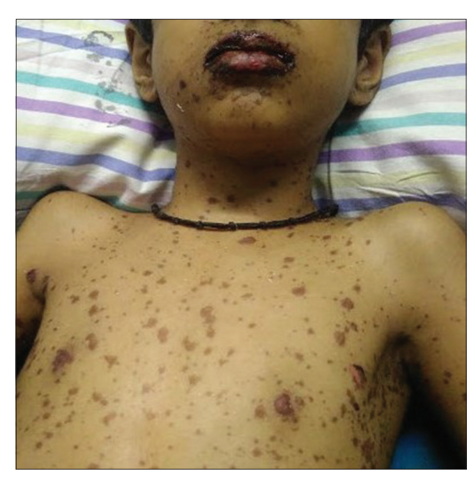
Figure 2: A child with Stevens-Johnson syndrome due to phenytoin

One hundred and sixteen (57.14%) patients with dermatological problems had associated systemic symptoms and signs, of whom 45/203 (22.16%) required admission and their diagnoses are shown in Table 3. The mean duration of hospital stay in patients with a primary dermatological diagnosis was higher (4.56 days) compared to other patients (3.83 days), but statistically