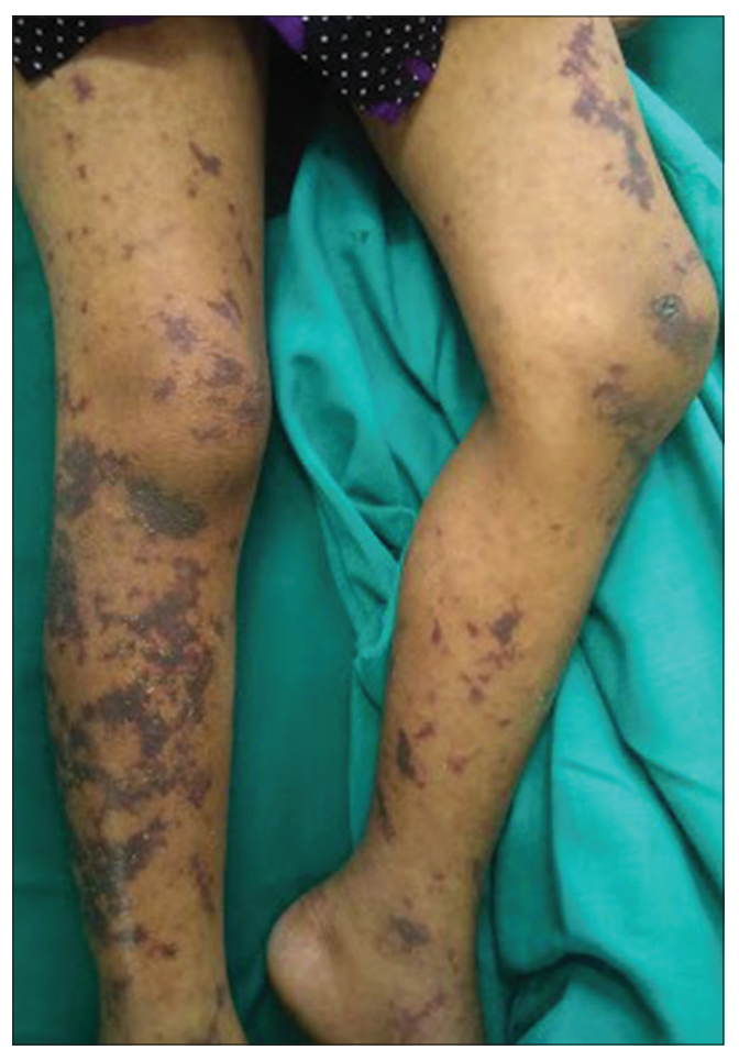
Figure 3: Sharply demarcated retiform purpura in a child with purpura fulminans

insignificant (P = 0.503). Mean age of hospitalized patients was significantly higher (6.11 years) than the nonhospitalized (4.44 years) (P = 0.013). Among the hospitalized, 25 (55.55%) patients satisfied the criteria for SIRS [Figure 6]. The associated systemic symptoms and abnormal laboratory investigations in patients with SIRS are summarized in Table 4. The mean duration of hospital