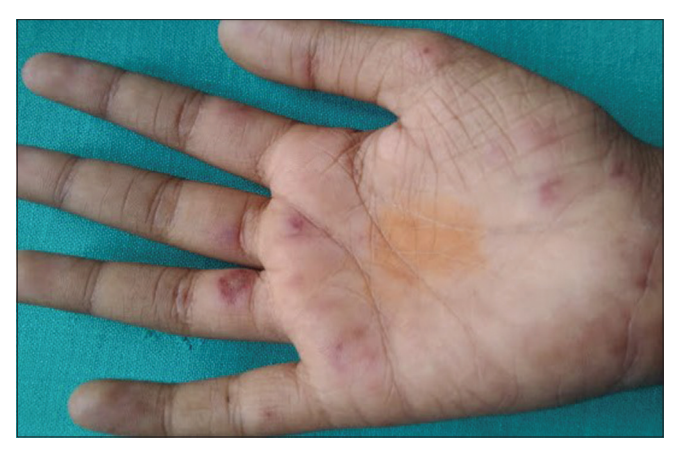
Figure 4: Multiple vasculitic lesions on the palm of a child with systemic lupus erythematosus

Majority (61.08%) of our children were in the preschool age group ( \leq 5 years) as similar to the literature from India and the West.<sup>[3,4,9]</sup> The prevalence of patients with skin lesions attending the PED in our study was lower than that reported in the world literature<sup>[2,3,6]</sup> but higher than the Indian studies.<sup>[4,5]</sup> As skin lesions secondary to trauma and burns were also included in some studies,<sup>[2,3]</sup> the reported prevalence