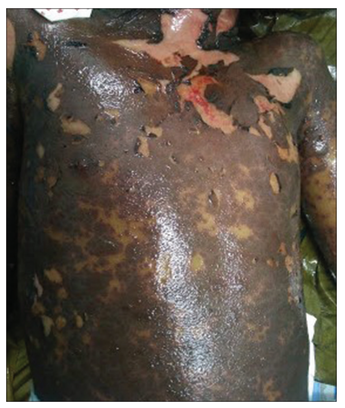
Figure 1: Sheets of skin detachment and erosions in toxic epidermal necrolysis

Two girls were diagnosed as systemic lupus erythematosus [Figure 4] of whom one had SIRS requiring admission.