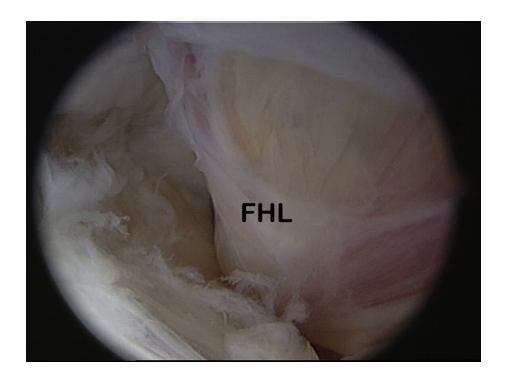
Fig. 4. FHL tendon after os trigonum excision.

days) postoperatively. AOFAS showed a mean pre-treatment score of 57.7, whereas postoperative AOFAS increased to 97.3 (95–100). Final pain scores of operated athletes were 1.0 for VAS (8.7 initial score) after a mean follow-up of 36.3 months (21–46 months).