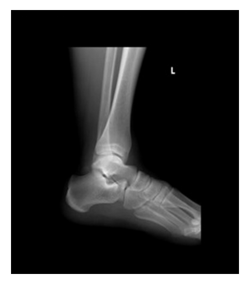
Fig. 1. Lateral radiograph of a 19 year-old football player with a 3-year professional background, showing a free bone structure belonging to os trigonum in talus posterior.