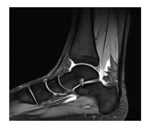
Fig. 2. Effusion is seen around os trigonum in T2W sagittal image of the ankle MRI.

ultrasonographic (USG) guidance. A single infiltration was performed on these patients as no improvement was observed for three players after two weeks and therefore surgical repair was the proposed treatment.