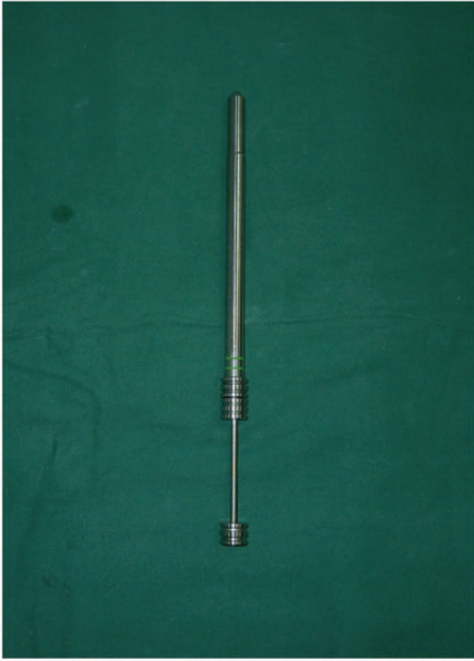
Figure 3. Image of soft tissue separator.

medullary canal (Figure 4), and a series of flexible reamers was used to increase the diameter of the femoral medullary canal while the reductor-T tape pin controlled the intermediate fracture fragment. Finally, the intramedullary nail was inserted along the guide wire to fix the displaced femoral shaft fractures (Figure 5) (the selected nail was 1 mm smaller in diameter than the last reamer). Fluoroscopy was conducted during the operation to monitor the procedure.