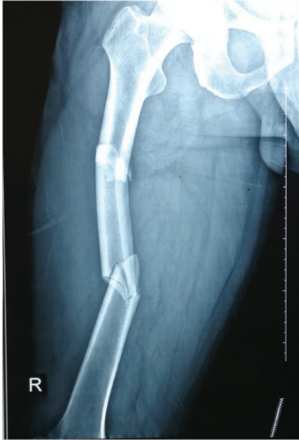
Figure 1. Representative image of IMFSFs. This image was obtained from a 36-year-old man with IMFSFs caused by a traffic accident. IMFSFs, ipsilateral multisegmental femoral shaft fractures.