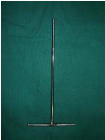
Figure 2. Image of reductor-T tape pin.

the screw head gradually increases from 4.5 mm at the beginning to 6.0 mm at the end with a 3.0-cm length. The screw head can be fixed to the unilateral cortical bone of the femoral shaft, and the surgeon can grasp the connecting rod and T tape handle to control the fracture site by the “joystick technique.”