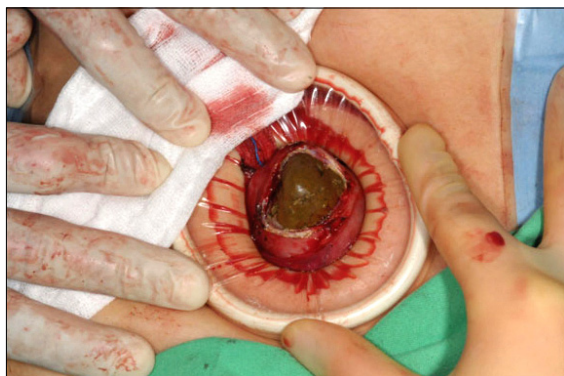
Fig. 3. Fecaloma removed through incision on colonic duplication.