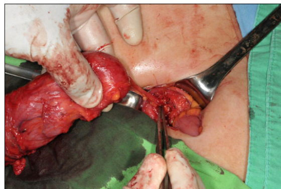
Fig. 5. Final attachment of blind end of colonic duplication to peritoneum overlying aortic bifurcation.