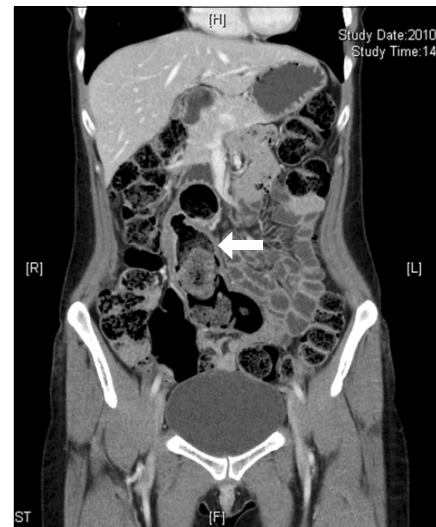
Fig. 2. Coronal view abdominal computed tomography scan showing longitudinal section of colonic duplication (white arrow).

Under general anesthesia, a 3 cm midline incision skirt-ing the umbilicus was made. Wound retractor (ALEXIS wound retractor, Applied Medical Resources Co., Rancho Santa Margarita, CA, USA) was placed through the incision. Initial digital palpation through the incision revealed a huge bowel-related mass situated just under the