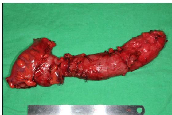
Fig. 6. Resected specimen showing large T-shaped tubular colonic duplication measuring 23 cm in length. Note that feeding vessels were ligated flush to wall of colonic duplication to avoid injury of vessels to native colon.

performed. We used the self-made ‘glove technique’ single port laparoscopic technique to perform a complete examination to look for any concomitant intra-abdominal pathology, peritoneal washout, and to ensure hemostasis. After closure, the length of the wound was 5 cm.