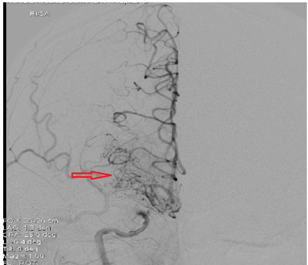
FIGURE 3: Cerebral angiography showed diffused intracranial vascular irregularity with stenosis