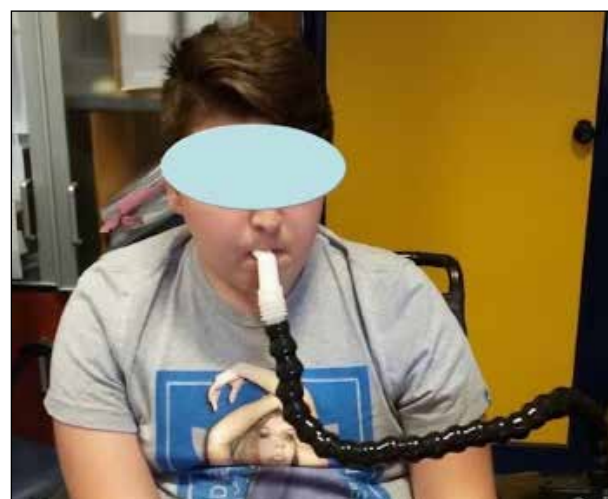
Figure 2- The patient during MPV.

He was adapted with mode ST-AVAPS, and parameters were the following: IPAP max 14 min 10, EPAP 6, Vt 650 mL; trigger flow 2.0 litres, 25% cycle, rise time 3, respiratory rate bk 10/min, Insp. Time 1.2 sec. Nocturnal pulse oximetry was performed, which confirmed the