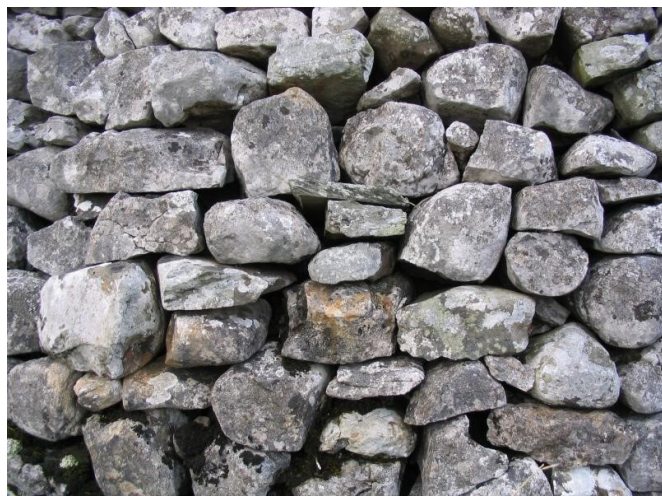
Figure 1 Dry stone wall.

health interventions is too diverse, flawed or inconclusive to support a more general conclusion about what should be done. 2