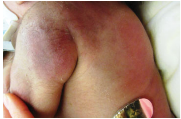
Fig. 1 Subcutaneous fat necrosis on baby N, on day 12 of life, with nodular, indurated, erythematous lesions in the right shoulder and interscapular space.

Despite this aggressive treatment, calcium levels did not show significant improvement (calcium was 3.56\text{ mmol/L} ), pamidronate was started on day 27 of life in a dose of 0.25\text{ mg/kg} , and level of total calcium postinfusion was 3.5\text{ mmol/L} with ionized calcium of 1.5\text{ mmol/L} . Given the small decrease in calcium levels, a higher dose of 0.5\text{ mg/kg} on three consecutive days starting on day 28 of life resulted in normalization of calcium levels. Total duration of hypercalcemia