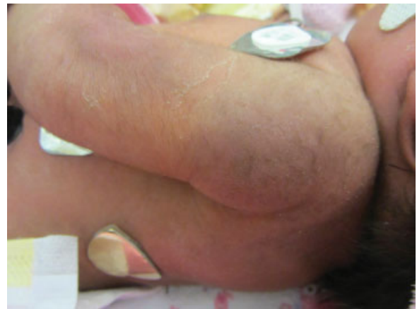
Fig. 2 Same infant on day 20 of life, lesions are less erythematous, started to resolve.

(with treatment) was about 1 week. No side effects were observed during treatment.