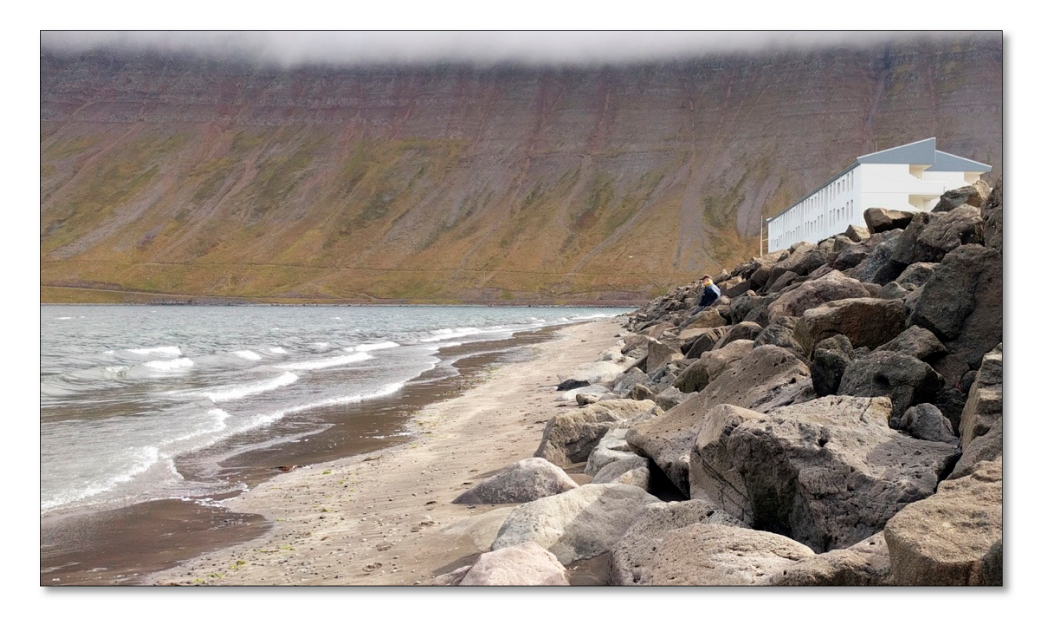
Figure 3. Fjarðarstræti Shore.

Fjarðarstræti Shore is about 450 m long, with black sand (Figure 3), which has formed below a loaded breakwater in recent years. Between the big rocks at the bottom of the breakwater, it is somewhat sheltered from view from the road, from other people on the shore, and also from harsh weather and winds. There is little flora and fauna on the shore, except for kelp, shells, occasional crucian carp, crab, and other things that have washed ashore. In addition, green beach vegetation can be seen along the shore in the spring and into the autumn. Similar to the above site, the shore is very often desolate, except for in the summer, when there are sometimes people walking and playing there, especially during nice weather. This site was chosen because it is the only spacious sand shore within a walking distance from the town, it's never crowded, and there is a great ocean view.