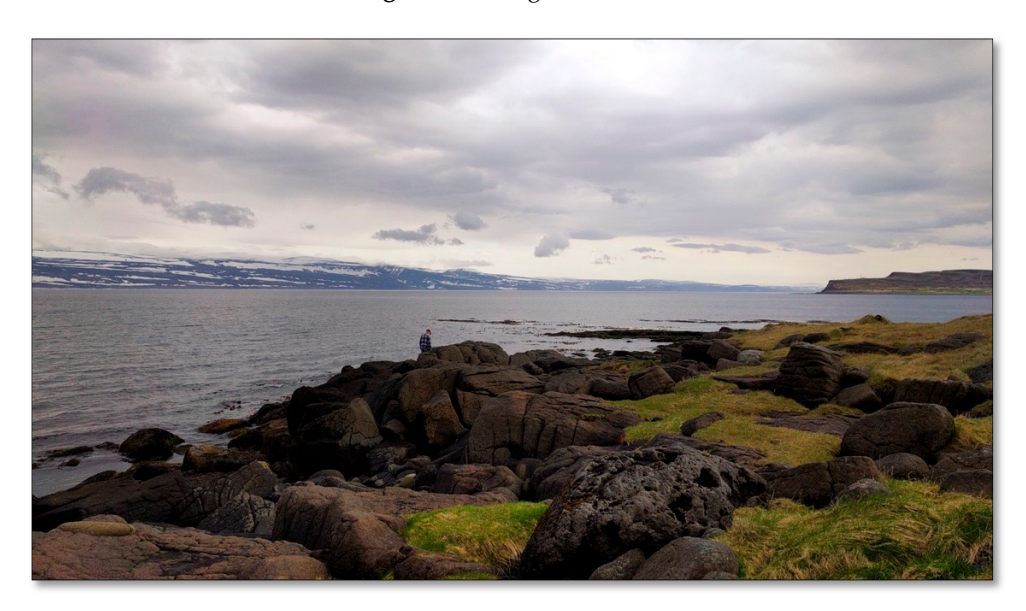
Figure 5. Skeljavík Shore.