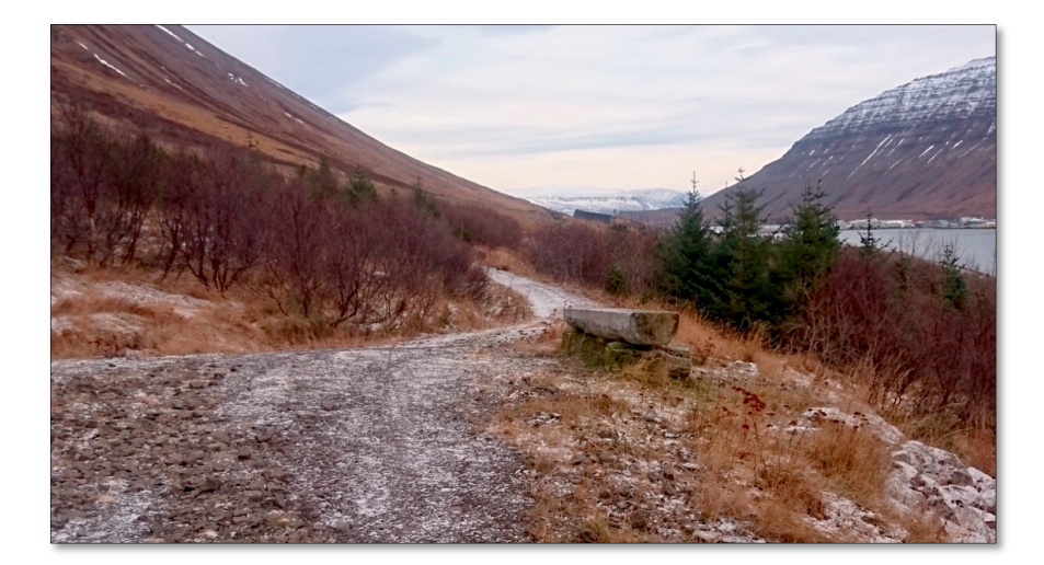
Figure 6. Forest site below Skíðavegur.