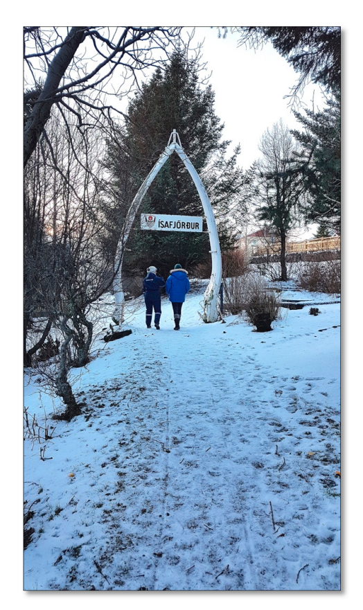
Figure 2. Jónsgarður Park.