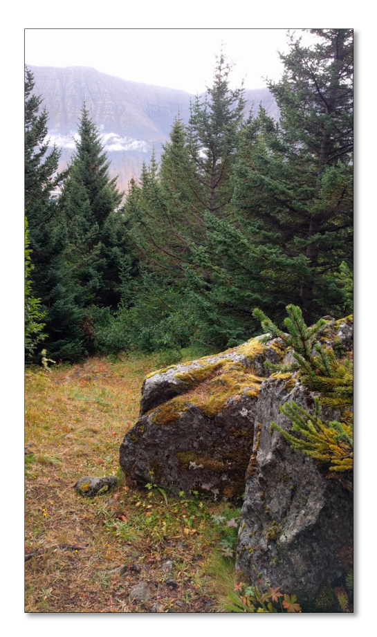
Figure 7. Forest site above Urðavegur.

The first trees were planted in the mature forest plot in 1945 (Figure 7). Most of the trees are conifers, but there are also some berry species, e.g., salmon berries, currants, and wild berries [41]. A gravel path runs through the forest across the hill, but narrower paths cross the area. Above the forest plot, there is a vegetation area, grass, and a variety of low vegetation, e.g., berry heather. Large rocks having collapsed from the slope have broken trees and formed sheltered spaces in the forest. It is mostly unoccupied on weekdays, though there are more people walking around in the summer than other seasons.