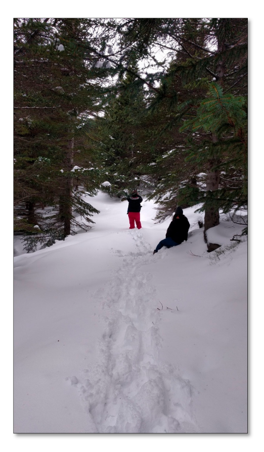
Figure 8. Tunguskógur forest.

Tungudalur is a valley quite sheltered from the wind and bad weather. There is a natural birch forest, with a forest plot (Figure 8) comprised of mainly conifers that were planted between 1955–1965 [42]. A gravel path runs through the coniferous forest; in addition, there are narrower paths around the area, and it is easy to access the forest through the many small clearings. Small wooden benches can be found scattered throughout, and by the main path, there is a table and some benches. The place is popular for outdoor activities, but mostly in the afternoons, on weekends, and in the summer.