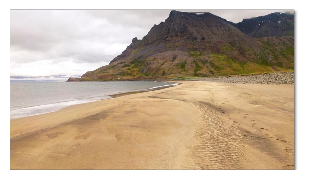
Figure 4. Bolungarvík Shore.