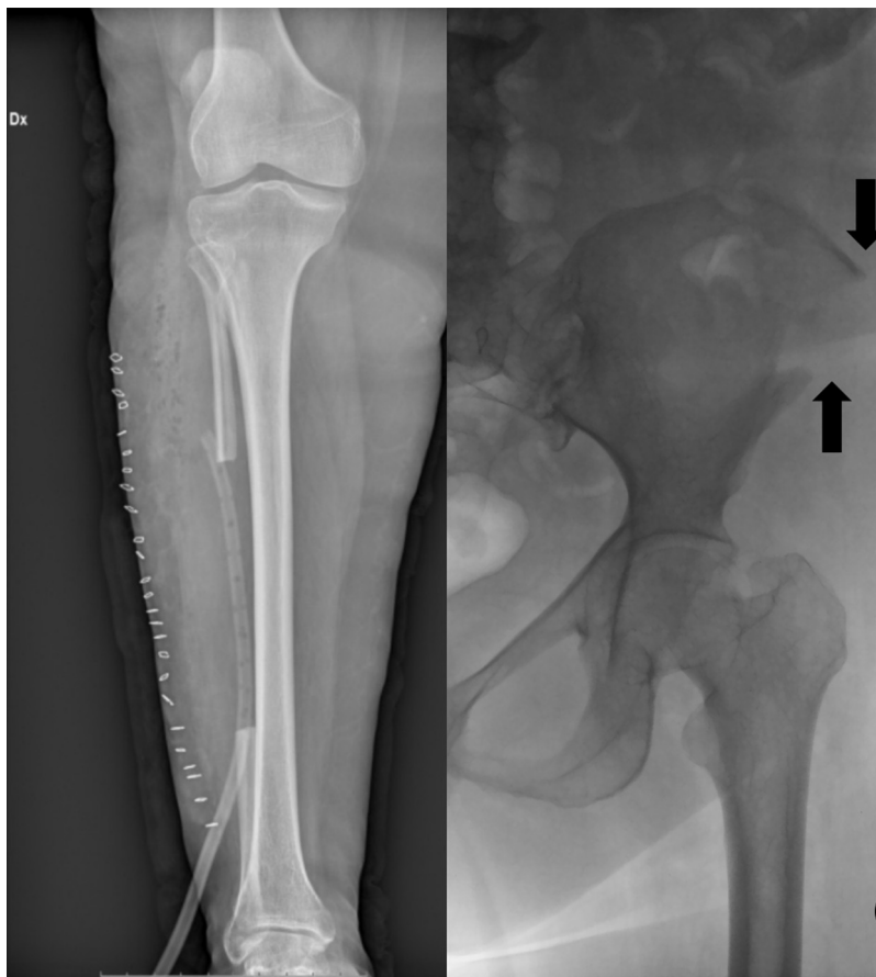
Fig. 2. Autograft bone from peroneal diaphysis (left); cortical bone from iliac crest (right).

approach. Non-union may occur after surgical treatment when a good reduction of the fracture or a stable fixation is not achieved. Systemic environment can be another cause of bone healing failure and non-union, but it is essential to respect biomechanical principles to reduce failure percentage.