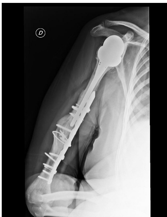
Fig. 4. 1 year post-operative x.ray.

mechanical stability (plate, screws and wires) and we combined a supportive treatment to osteogenic processes (autologous bone grafts and therapy with Teriparatide) [13]. Our method follows the Giannoudis' "Diamond concept" about fracture healing [14].