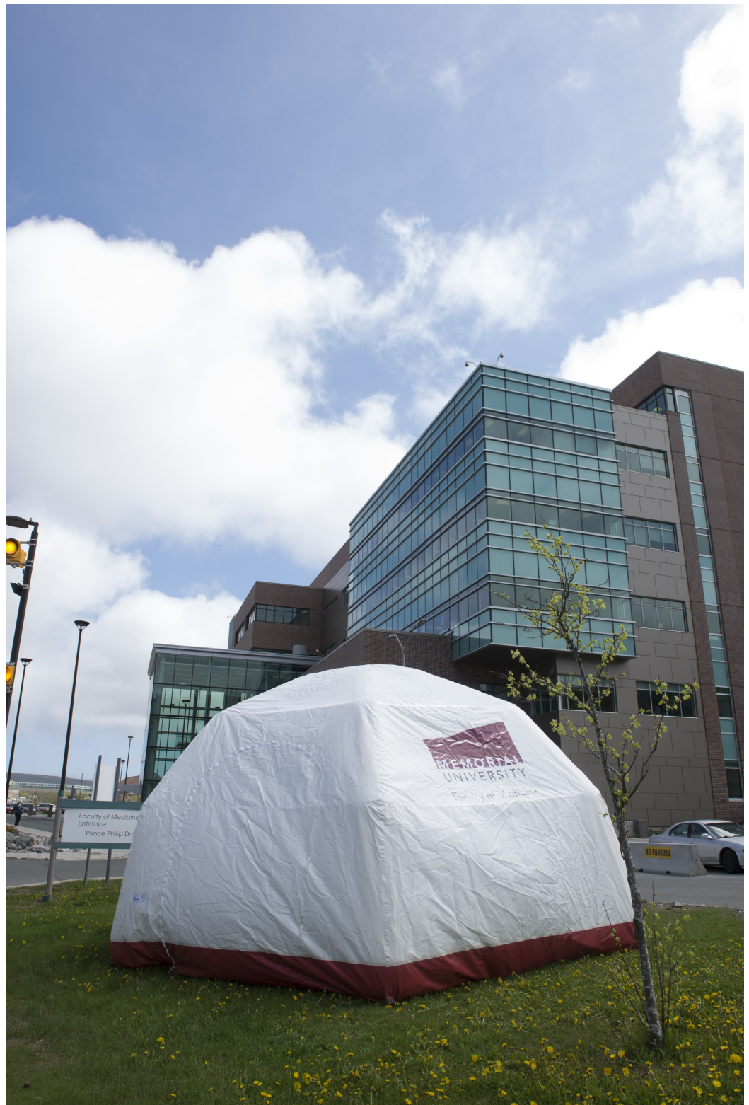
FIGURE 2: Mobile tele-simulation unit prototype outside Memorial University of Newfoundland.

required training sites as opposed to needing several simulation centers built in rural areas – when they may not be utilized frequently. Figure 2 displays the initial prototype of the MTU's development.