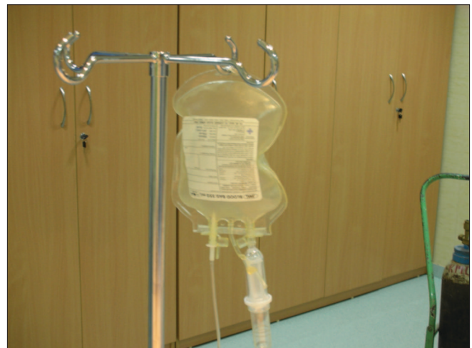
Figure 1: The blood bag inflated with CO 2 is depicted

The system developed at our institute has been used for CO 2 angiograms for many years now. It consists of a standard blood bag (readily available) connected to a CO 2 cylinder [Figure 1]; this is done in order to avoid direct transmission of pressure from the cylinder to the vasculature under