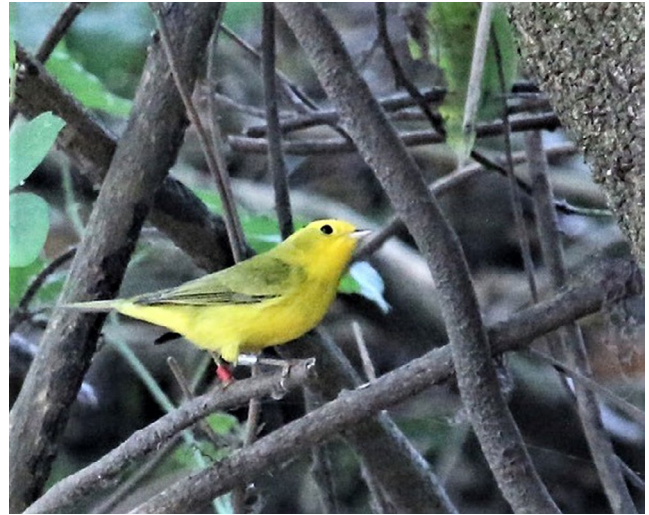
FIGURE 1 A color-banded male Wilson's Warbler at my study site at the Tilden Nature Center in the East San Francisco Bay Area.

The majority of studies on definitive prebasic molting, or timing of autumn migratory passage which can relate to timing of molt, have involved late or post-breeding season mist netting (Carlisle et al., 2005; Junda et al., 2020; Pyle et al., 2018; Ryder & Rimmer, 2003; Wiegardt, Wolfe, et al., 2017; Yong et al., 1998). One limitation of these studies is that they cannot directly evaluate the molting and behavior of individuals that possibly remain on breeding grounds after the majority of individuals have departed for migration. Thus, possible late nesting and delayed molting in those individuals cannot be assessed. Also, contrary to direct observation of a color-banded and sexed study population, migrating, sexually monomorphic species can be difficult to sex by rapid, non-invasive means in the autumn. Possibly based on that difficulty, and the fact that in many