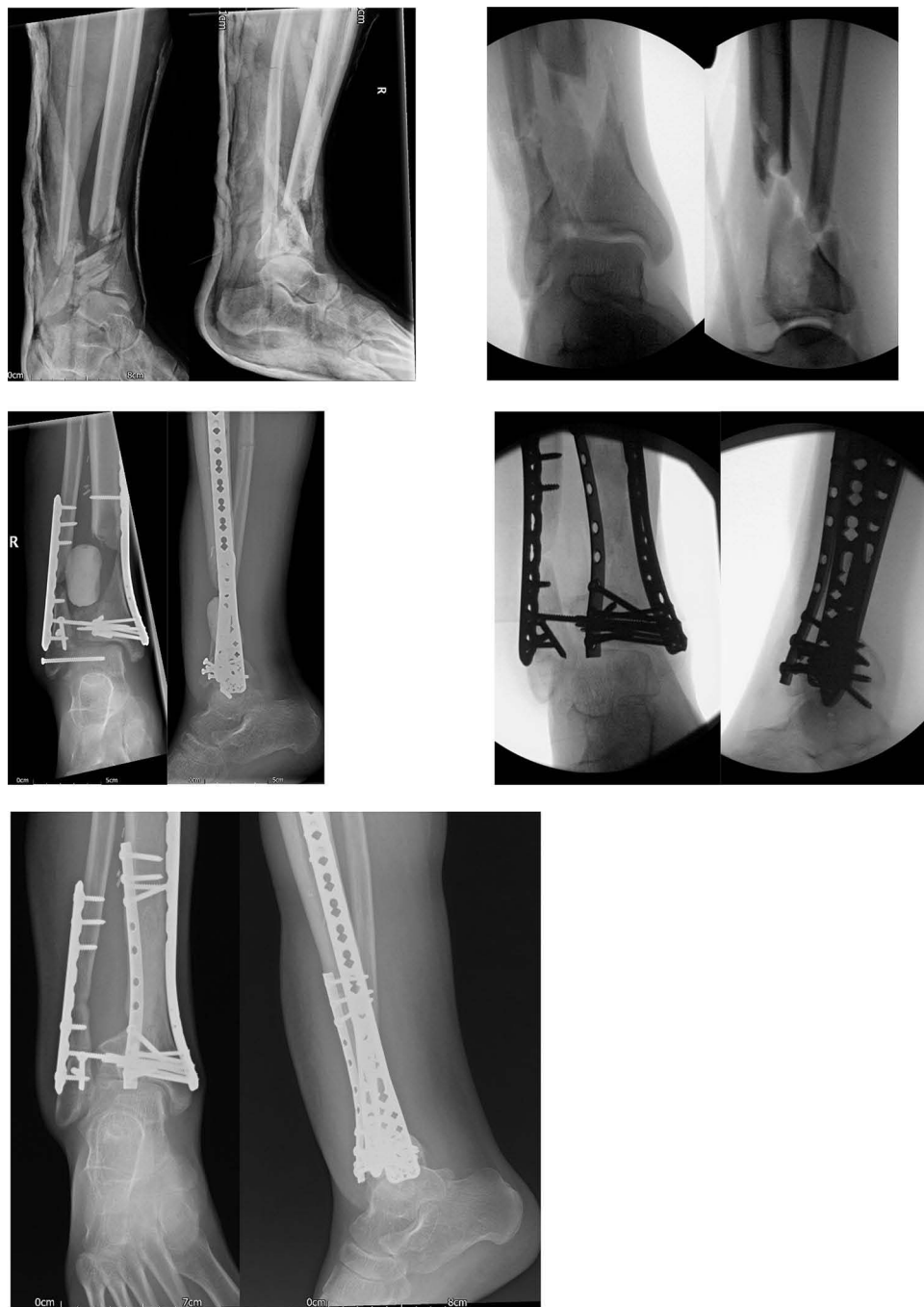
Figure 1 AP and lateral radiographs of an open pilon fracture taken on presentation in the Emergency Department (top left). Large bone defect in metaphysis of distal tibia following initial debridement procedure (top right). Open reduction and internal fixation of fracture, and cement deposition into the area of the bone defect (middle left). Cement extracted and replaced with autologous bone graft from patient's contralateral tibia obtained using reamer-irrigator-aspirator (middle right). Outpatient clinic x-rays demonstrating fracture union (bottom left).

can help bridge bone defects, thereby allowing more circumferential bone on bone contact and subsequent increased construct stability (Figure 2). It is imperative that a combination of debridement and disinfection techniques are performed to reduce the bacterial load of these fragments prior to their re-incorporation at the fracture site. This can take place at an early or delayed stage (greater than one month 16 ) either during the index or a subsequent procedure respectively.