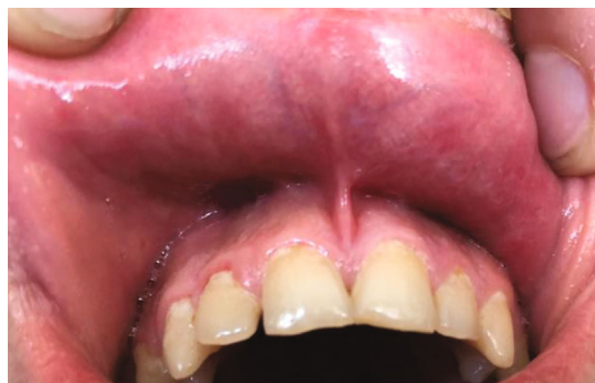
FIGURE 3: The mucous membrane of the lip with resolution of aphthous ulcers.

of adhesive films were performed in the clinic by the treating clinician, and later, it was applied by the patient at home. The patient was trained on how to use these films. The films were applied twice daily until the ulcers healed. In this reported case, aphthous ulcers in the mucous membrane cleared up within two weeks (Figure 3). The patient will be followed up by the general medical practitioner for monitoring any systemic conditions.