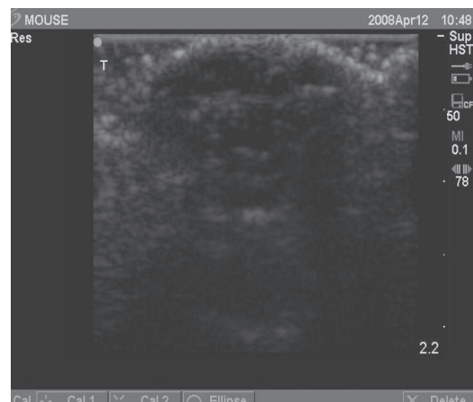
Figure 1 Animal ultrasonic inspection of pink neoplasm: tumor formation.

Eight days after K562/A02 cells inoculation, the tumors reached a volume of more than 100 mm 3 . The mice were