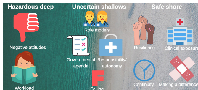
Figure 2 Conceptual model detailing the facilitating factors and barriers to student PA identity formation. There are three sections to this conceptual model. The 'safe shore' is solid ground on which student PAs can easily find their footing and represents the factors which assist student identity formation. The 'hazardous deep' can easily drown a student, and represents barriers to student identity formation that can overwhelm a training PA. The 'uncertain shallows' is a hinterland between the safety of the shore and the dangers of the deep and represents factors that, depending on context and agency, can either help or harm student PA occupational identity formation. PA, physician associate.

Some students felt so frustrated by this lacking progress that their professional identity already showed signs of transformation into the professional identity of a medical student, which is perceived as more accessible and progressive than that of a PA's.