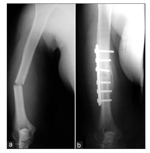
Figure 1: (a) Preoperative (b) postoperative radiographs of the humerus showing humeral shaft fracture. Note that the most proximal screw protrudes through the anteromedial cortex

of symptoms of CTS after removal of the implants. At 2 weeks later, however, the patient experienced a significant relief of the tingling over fingers. At last review, 6 months after the implants removal, her sensations returned to near normal with full movement of the fingers. Although mild thenar atrophy was still present, the patient remained asymptomatic and denied additional carpal tunnel decompression surgery as she had no great difficulty in carrying out her daily activities.