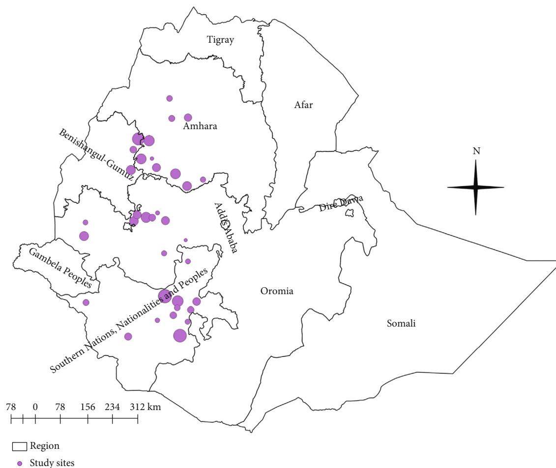
FIGURE 1: The spatial distribution of cattle trypanosomosis in different regions of Ethiopia [3].

Since there was no previous study undertaken in the specified study district, the expected prevalence was assumed to be 50%. Accordingly, the sample size computed was 384 cattle, but to increase the level of precision, the sample was increased to 400.