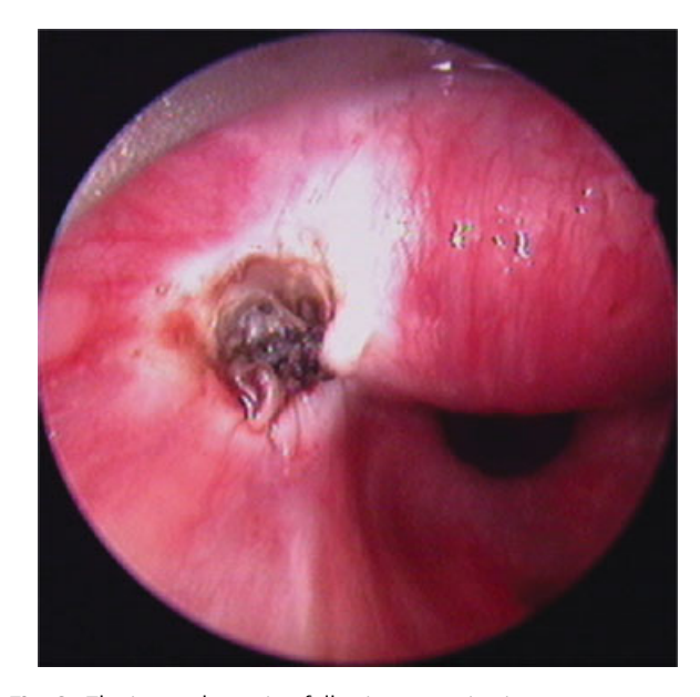
Fig. 3 The internal opening following cauterization.

A direct hypopharyngoscopy is done and the internal opening was visualized. A 0° Hopkins rod endoscope with a camera is inserted into the hypopharyngoscope. This provided a magnified image of the finding, which enabled photographic