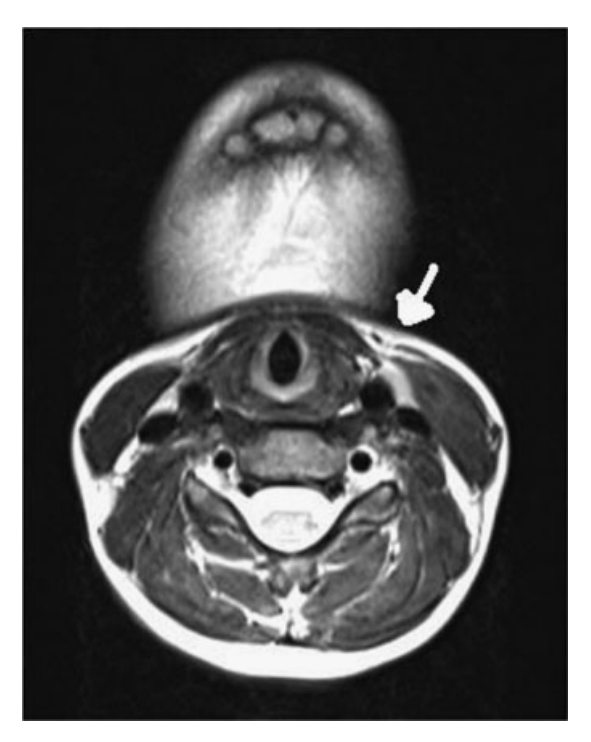
Fig. 4 CT scan of the neck showing the sinus communicating with the left pyriform sinus.

documentation and was also used for teaching purposes. The opening is then cannulated by a guide wire from CV catheter and was cauterized using monopolar cautery.