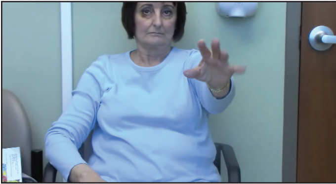
Video 1. A Rest Tremor in the Left Upper Extremity Associated with Bradykinesia. There is a re-emergent postural tremor in the left upper extremity after a latency. A re-emergent kinetic tremor is seen in the left arm with repeated attempts to drink water from a cup.

pouring, and so on. This is in contrast to PD, where the tremor is present mainly at rest and minimally with action. Therefore, the tremor of PD does not interfere while doing a task such as eating or drinking, but can be present while holding an object which represents a re-emergent postural tremor. In a study published recently, it was found that kinetic and postural tremor can occur in the absence of rest tremor in PD, but