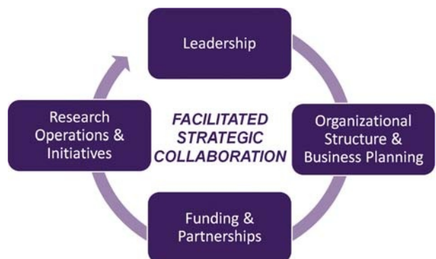
FIGURE 1. Strategic Map for Innovation.

Strategic collaboration, communication, and identification of resources are critical components of the organizational structure necessary to accomplish the underlying research to establish an early-detection protocol. Commitments from academia, government, industry, and philanthropy are essential to the design of a research and development plan, with an early cost/benefit analysis as a factor. Both short-term and long-term business goals must be articulated. Although biotechnology companies engaged in biomarker development are intuitively part of such an effort, it is important to emphasize that companies that are active in the treatment space should be engaged as well because they are most likely to benefit from the increased survival of PDAC patients and their requirements for ongoing pharmaceutical support. The involvement of government agencies will be beneficial through their