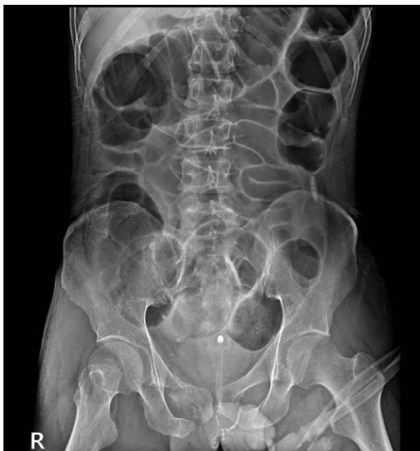
Figure 3. Prolonged ileus. The paralytic ileus was due to pelvic trauma and lasted more than 3 days.

In the total study population, the average duration of ileus was 5.2 \pm 4.7 days. As expected, the average duration was longer in the prolonged ileus group ( 8.0 \pm 4.2 days) and shorter in the non-prolonged ileus group ( 1.2 \pm 0.4 days, P <.001 ). The overall mortality rate was 12.0%, and there was no significant