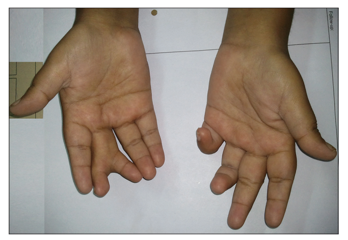
Figure 1: Picture showing central polydactyly in right hand and clinodctyly in left hand