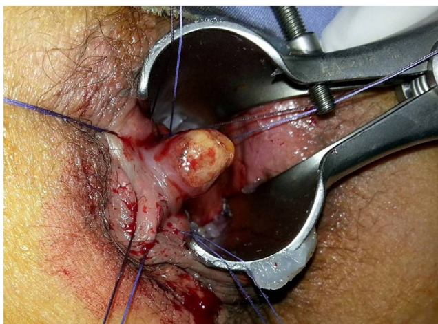
Fig. 1. Per anal examination showing the exophytic mass of 2 cm arising from the anal canal at 7'o clock position.