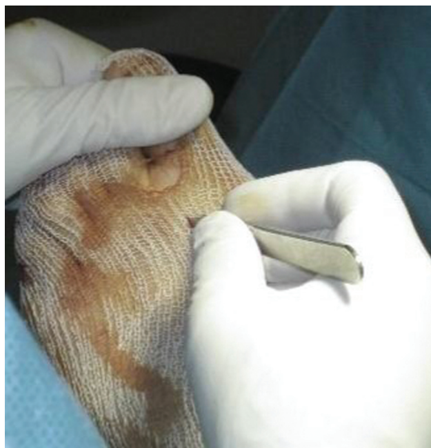
Fig. 1 Percutaneous release of the adductor hallucis tendon.