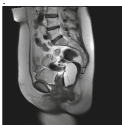
Fig. 2 Post-operative midsagittal MRI during Valsalva showing a rectal obstruction around 10 cm from the anus (rectum was filled with ultrasound gel)

In conclusion, in this patient, a rectal obstruction occurred after mesh implantation for a posterior compartment prolapse. It was only diagnosed after making a dynamic MRI. The obstruction was solved by splitting the mesh in the midline.