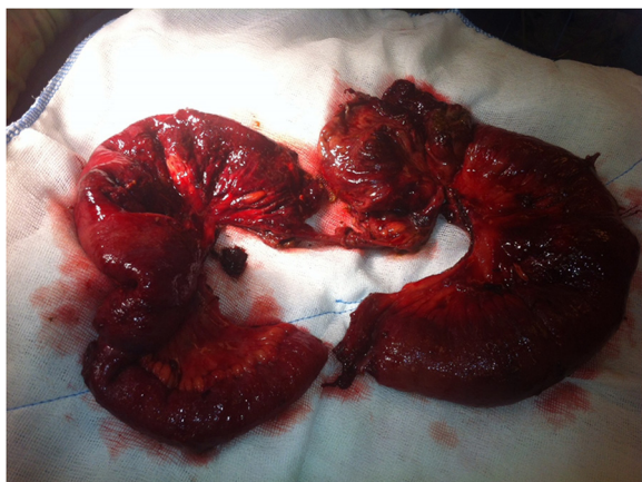
Figure 3 Specimen image: resected specimen of the small bowel due to perforation related to ureter torsion.

Peritoneal adhesions may develop after pelvic and abdominal surgery or their combination [11]. Additionally, ingeminate pelvic or abdominal surgery increases the possibility of intra-abdominal adhesions. Retrospective studies have reported that 32 to 75 percent of patients who undergo abdominal reoperations encounter adhesion-related intestinal obstruction [12]. In contrast to congenital or postinflammatory adhesions, which are mostly asymptomatic, postoperative adhesions cause 40 percent of all cases of intestinal obstruction [13]. Intra-abdominal adhesions are predominantly diagnosed intraoperatively. Taking a careful history can substantiate the suspicion of adhesions; no other clinical investigations or imaging procedures enable a confident diagnosis [14]. In our case, we performed CT imaging due to the suspicion of a recurrent mass, but the CT images could not clarify the etiology of the bowel obstruction.