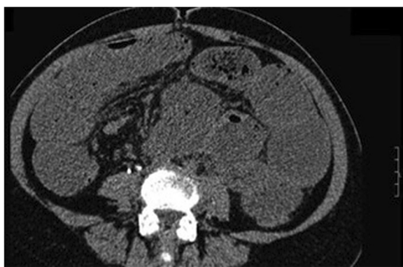
Figure 1 Computed tomography image: a group of poorly enhanced and thickened bowel walls on non-contrast computed tomography.

An aggressive fluid-electrolyte resuscitation (20ml/kg/hr) and antibiotics (ceftriaxone 2 gr/ 24h and metronidazole 500mg/6h intravenous) administration was started immediately in the intensive care unit. Because these radiological findings were suggestive for obstruction and bowel ischemia, our patient underwent emergency surgery six hours after admission.