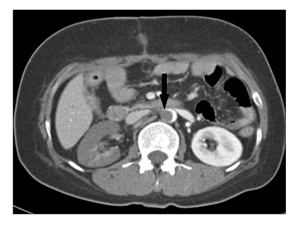
Fig. 1. Abdominal computed tomography shows intraluminal aortic thrombus (arrow) with infarction of the right kidney.