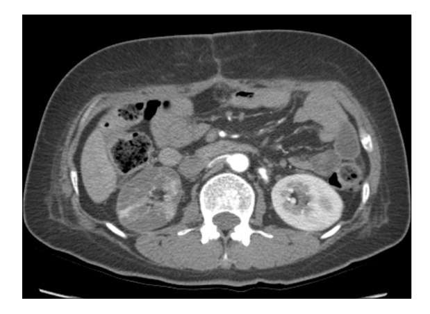
Fig. 4. Follow-up computed tomography on 7 days after balloon catheter thrombectomy, shows complete resolution of the aortic thrombus. Right renal artery is partially recannalized.

While there are increasing number of reports on thoracoabdominal aortic thrombus as a cause of embolism, the optimal treatment is remains controversial [5]. Systemic anticoagulation, aortic thromboendarterectomy or place-