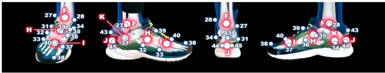
Figure 2. Marker placement multi-segmental model.