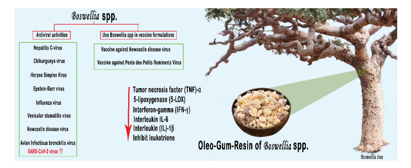
Fig. 2 Antiviral activities of Boswellia species

Next to being exerted for vaccine formulations, Boswellia species can produce a variety of bioactive constituents with the potential of inhibiting different types of DNA or RNA viruses similar to Influenza, Hepatitis C, Chikungunya, Vesicular stomatitis, Epstein–Barr, Herpes Simplex, Newcastle disease, and Avian Infectious bronchitis viruses (Fig. 2(.