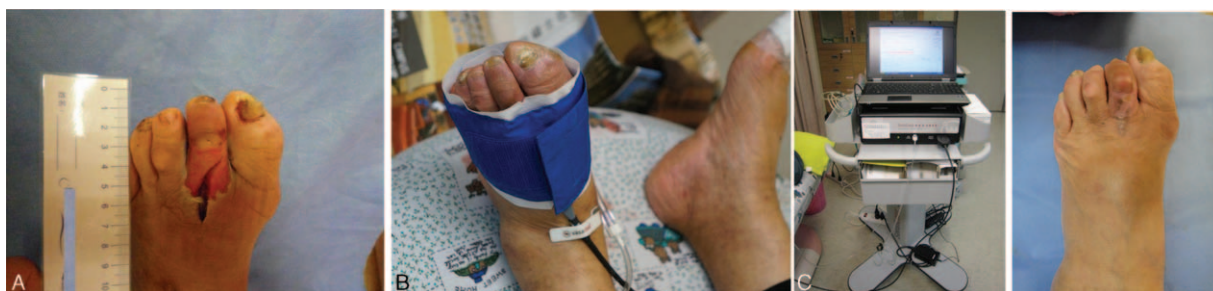
Figure 2. (A) This is a 62-year-old female patient with 12 years of type 2 diabetes mellitus. The Wagner Gr. III deep diabetes foot ulcer over the left 2nd toe was as demonstrated. (B) Modalities for skin perfusion pressure measurements. (C) The completely healed wound after 3 months of follow-up.

Table 2 demonstrated the comparison of SPP before and after Buerger exercise. The result showed that Buerger exercise significantly increased the level of SPP by more than 10 mm Hg (58.3 vs 70.0 mm Hg, P < 0.001 ). We further analyzed the initial dorsal foot SPP values and the presence of ulcer. In terms of pre-exercise dorsal foot peripheral circulation, the result from initial SPP values indicated that Buerger exercise increased the level of SPP in severe ischemia ( n = 5 , 22.1 vs 37.3 mm Hg, P = 0.043 ), moderate ischemia ( n = 14 , 42.2 vs 64.4 mm Hg, P = 0.001 ), and borderline-normal ( n = 7 , 52.9 vs 65.4 mm Hg, P = 0.028 ) groups, respectively. However, the 20 feet with SPP levels more than 60 mm Hg were not improved significantly after exercise ( P = 0.239 ). As to the presence of ulcer, the results revealed that Buerger exercise increased the level of SPP in either unwounded feet (58.5 vs 66.0 mm Hg, P = 0.012 ) or wounded feet (58.3 vs 71.5 mm Hg, P < 0.001 ). We also drawn Table 2 to Fig. 3A and B.