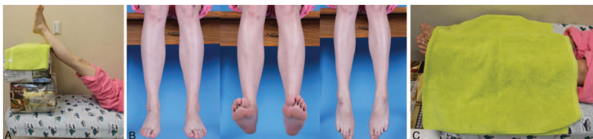
Figure 1. (A) Step 1 of Buerger exercise. (B) Step 2 of Buerger exercise. (C) Step 3 of Buerger exercise.

Thirty patients consisted of 16 male and 14 female with a mean age of 63.4 years old (SD=13.7 years) were enrolled in this study. Among them, 26 patients had unilateral and 4 patients had bilateral DFU. We measured and collected SPP data of 46 feet, including 34 wounded feet and 12 unwounded feet. The mean duration of diabetes was 13.6 years (SD=8.7 years). Of the 34 wounded feet, 23 (68%) and 9 (27%) feet were classified as Wagner class II and III, respectively. The status of wound was monitored 3 months after they were first instructed to do the Buerger exercise in our outpatient clinics. The majority of the ulcers were either completely healed (n=9, 27%) (Fig. 2A–C) or still improving (n=14, 41%). Six ulcers (18%) were static, 3 ulcers (9%) were progressed, and 2 (6%) suffered from toe amputation (Table 1).