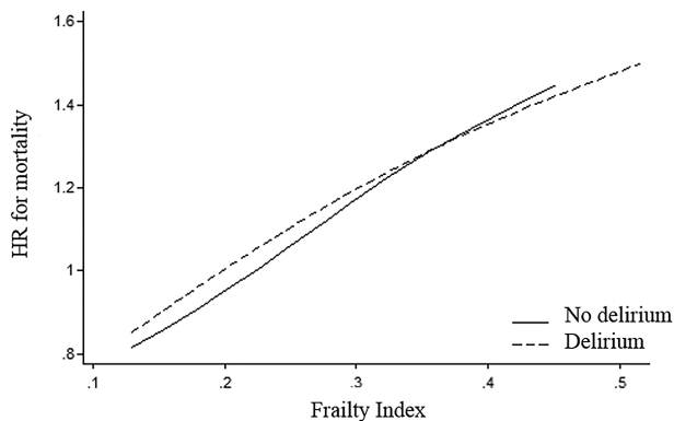
Figure 2. Relationship between frailty and mortality, by delirium status restricted cubic splines modeling relationship between frailty and mortality. The linearity suggests a continuous relationship between frailty and mortality. When stratified by delirium, the lines intersect suggesting greater effects with delirium at lower levels of mortality ( p = .07 ).

from delirium is highest in the fittest patients. This highlights the crucial importance of preventing, detecting, and treating delirium in any patient, and recognizing it as a serious condition with prognostic significance.