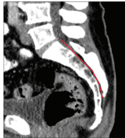
Figure 1: Sagittal view of the sacrum. Bending of the sacral and lumbar spine demand flexibility of the endoscope of at least 30° and 50° to accommodate the ventral and dorsal curvature, respectively.

in the center of the sacral and lumbar canal, indicated as a difference from the straight line (180°) corresponding to kyphosis and lordosis.