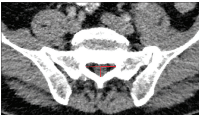
Figure 2: Axial view of the lumbosacral transition. To reach the lumbosacral transition for surgical interventions an endoscope with a minimal length of 290 mm should be developed to accommodate 95% of the patients.

In an autopsy specimen study by Witte et al. , [11] data from 117 sacra of cases aged 69 years and older were measured