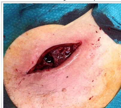
Figure 3: Exposure was made via a linear incision starting over the medial aspect of the clavicle and extending over the manubrium sterni. The residual defect after resection measured 1 cm in width and 1 cm in depth.

A 58-year-old man presented with a 5-week progressive left shoulder pain and functional impairment. There was no history of trauma, fever, chills, night sweats, malaise, or injections. His medical history only included multiple myeloma, currently in partial remission. A 4-week empiric antibiotic course with oral flucloxacillin and then ciprofloxacin had been previously prescribed with no improvement. Physical examination showed an afebrile, well-nourished man with an erythematous, swollen and tender area over the left SCJ and medial clavicle (Fig. 1a). At the beginning no skin wound or fistulae were present. A fluctuating mass was palpable and left shoulder motion was painful. Despite the full passive range of motion, painful