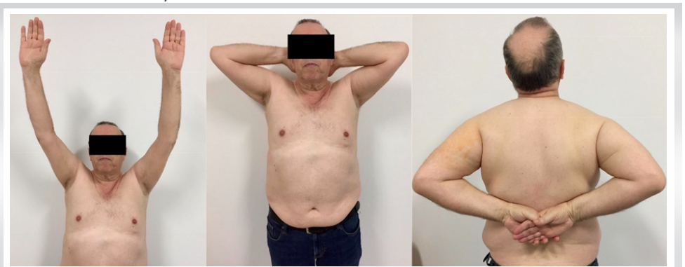
Figure 4: At 2-week follow-up visit, the patient presented a full range of motion of his left shoulder without any pain.