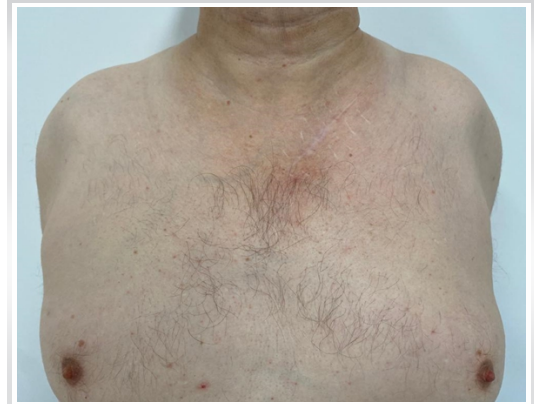
Figure 6: At 18-months follow-up, there were no signs of recurrence and the patient was completely functional without any pain or tenderness in the surgical region.

restriction of active movement was present: 120° of forward flexion, 90° of abduction, 20° of external rotation and limited internal rotation to the level of the 5th lumbar vertebra. 2 weeks later, a fistula with a purulent discharge was documented (Fig. 1b).