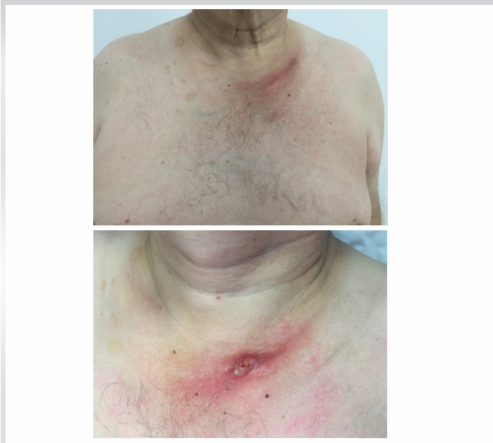
Figure 1: (a) Erythematous and swollen area over the left sternoclavicular joint and medial clavicle at presentation. (b) Fistula and purulent fluid drainage.