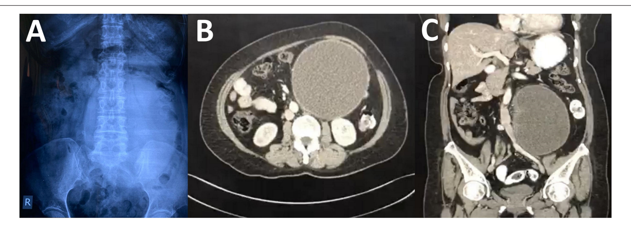
FIGURE 1 (A) Abdominal radiograph showing a huge oval radiopaque lesion on the left side. There was no dilated bowel visualized. (B) Contrast-enhanced computed tomography (CT) of the abdomen at axial phase showing a large well-defined homogenous lesion. (C) The homogenous lesion visualized at the coronal section

Johan et al. Benign Retroperitoneal Cyst