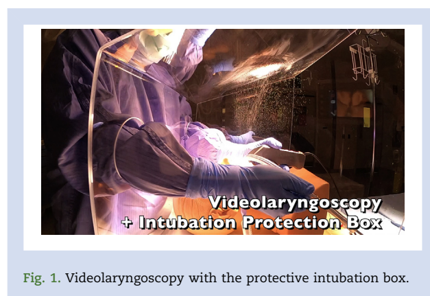
Fig. 1. Videolaryngoscopy with the protective intubation box.

located outside the box including gown, face shield, neck, and hair (Fig. 1).