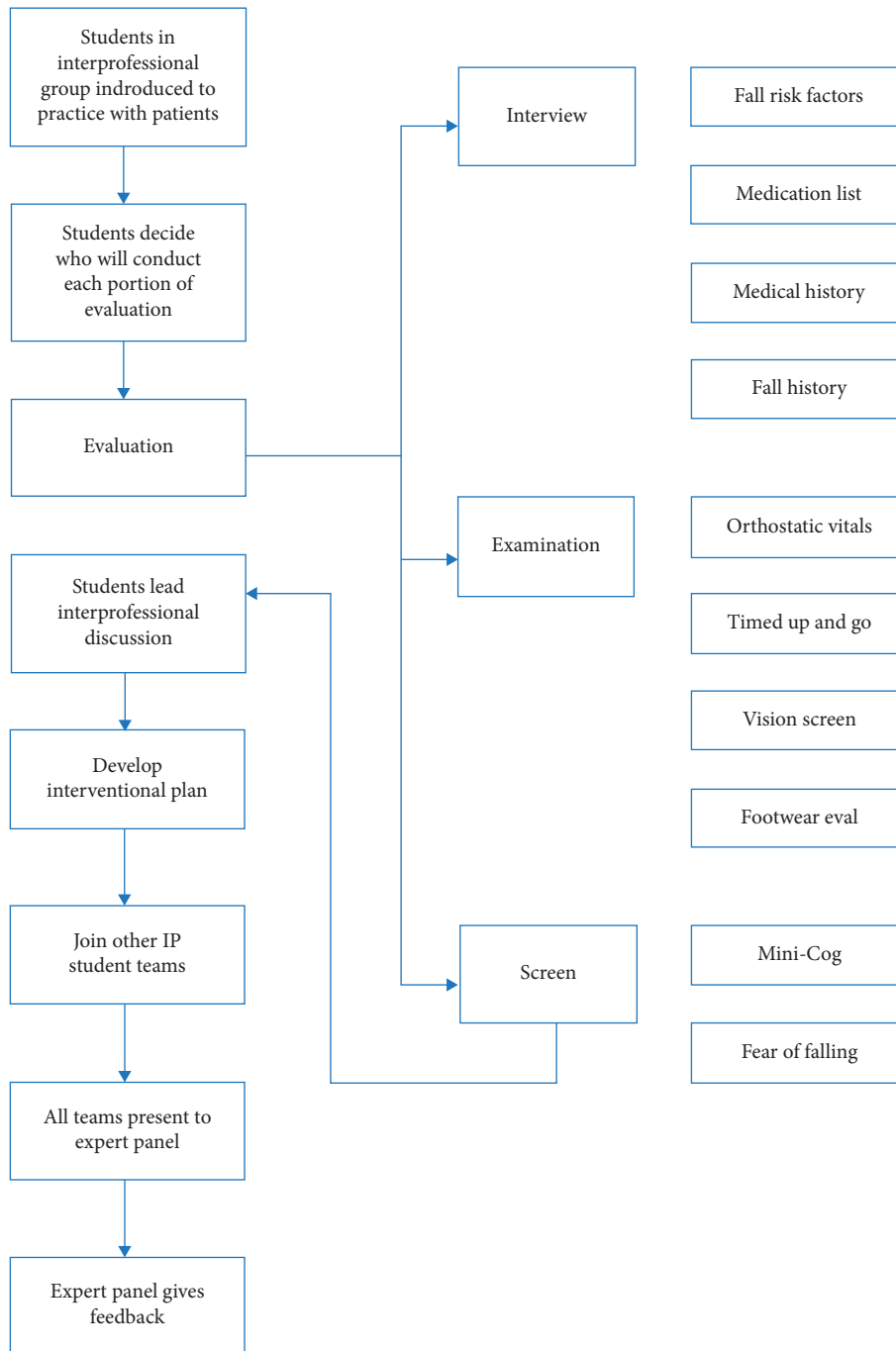
FIGURE 1: Standardized patient session flow.

and each group got a different standardized patient. Students decided amongst themselves who would obtain each portion of the assessment. Often, there was more than one discipline present who could obtain different pieces of information; for example, nursing students or paramedic students could obtain a blood pressure. Facilitators were present to ensure patient safety, answer questions, and maintain session timing but otherwise did not participate in the student-led session. Afterwards, students joined other small IP groups to present their patients and recommendations to an expert panel that included the