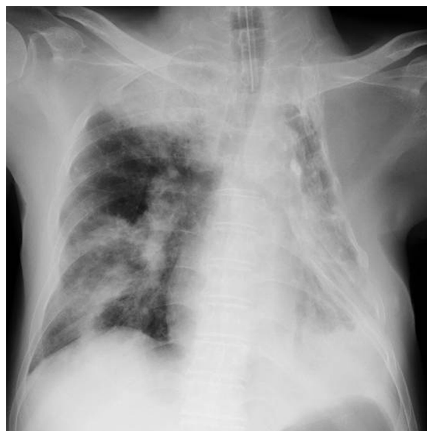
Figure 1 Chest radiograph on admission.

Gram staining of endotracheal-aspirated sputum revealed a large number of neutrophils, and light microscopy at high magnification (1000×) showed numerous fibrous constituents (Figure 2A–E). The same specimens were analyzed using immunohistochemistry with DAPI (4',6-diamidino-2-phenylindole) staining (Invitrogen, Carlsbad, CA) for DNA detection (Figure 2A), anti-human histone H3 mouse monoclonal antibody (MABI0001, MAB Institute Inc, Sapporo, Japan) for histone (Figure 2B), and anti-human neutrophil elastase rabbit polyclonal antibody (GTX72042, GeneTex Inc, Irvine, CA) for neutrophil elastase (Figure 2C). Figure 2D is a merged photograph of Figure 2A–C. The specimens were visualized using a fluorescence microscope (BZ-9000, Keyence Corporation, Osaka, Japan).